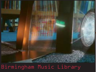
Birmingham Music Library