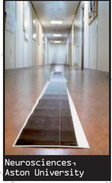
Neurosciences, Aston University