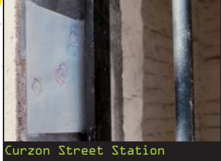
Curzon Street Station